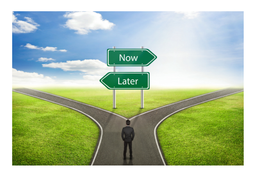
Should You Invest in Your QMS Now or Wait?

QMII potential clients often ask how soon we see a return on investment (ROI) after implementing a Quality Management System and our answer is ..